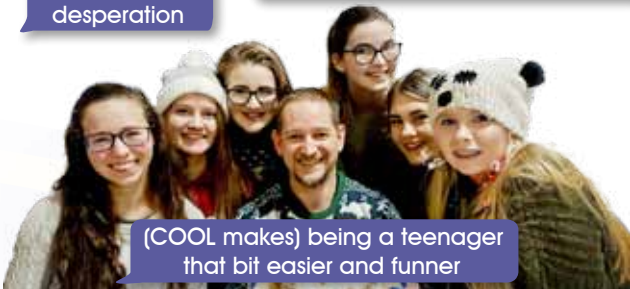
(COOL makes) being a teenager that bit easier and funner

Your school assemblies always left the kids smiling and uplifted